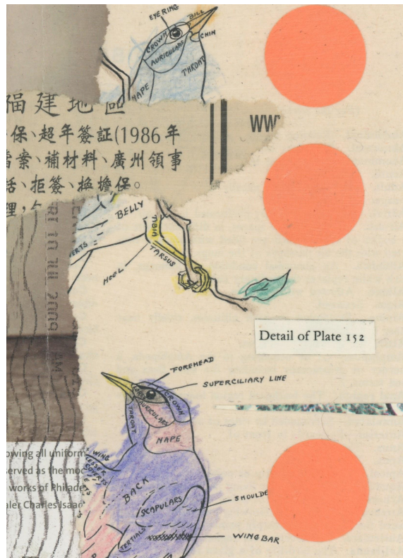
Detail of Plate 152